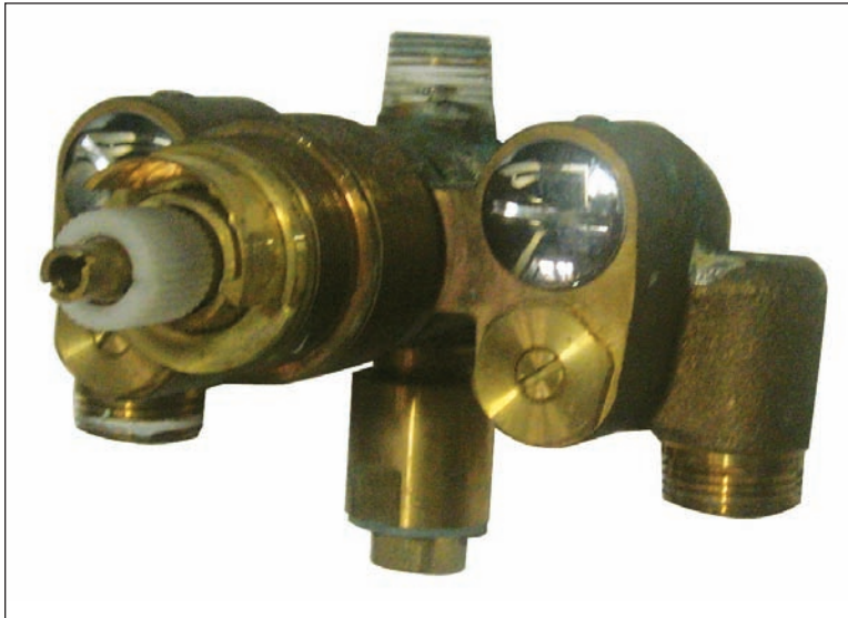
TSKT - SMA Thermostatic Mixing Valve