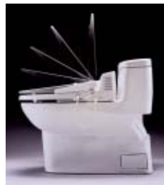
Engineered with TOTO's SoftClose Seat to eliminate annoying "toilet seat slam"

Like all TOTO Washlets, Chloe draws water directly from your home's fresh water supply, so the Washlet water is always convenient and fresh. Plus, the nozzle self-cleans automatically before and after each use. All Washlet seats are made from antibacterial plastics and feature the TOTO SoftClose hinge to eliminate annoying "toilet seat slam."