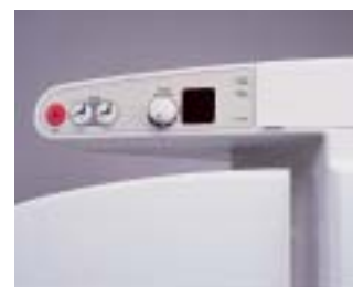
Convenient activation panel