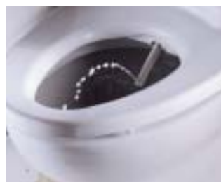
Gentle warm water cleansing

The Chloe Washlet is appropriate for both men and women. Seniors, children or those with limited mobility may find it to be especially helpful. Everyone at any age can enjoy regular use.