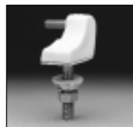
One Piece Stainless Steel Hinge