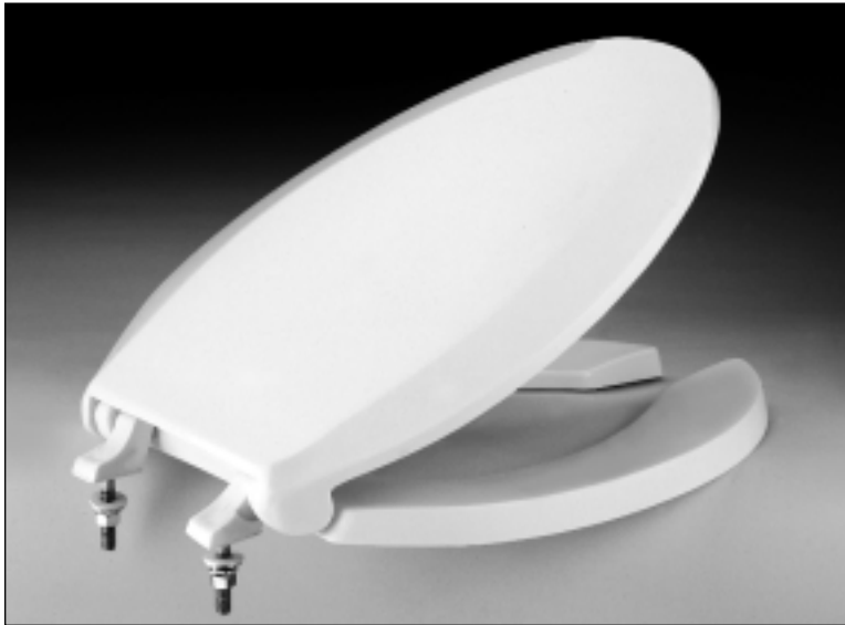
SC134 - Open Front With Cover For Elongated Bowl