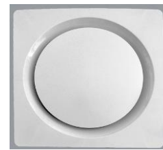
G6 (OR) • G6 (S) • G6 (W) Grille

UL/CUL Listed for installation over tub/shower enclosure when used with GFCI circuit wiring