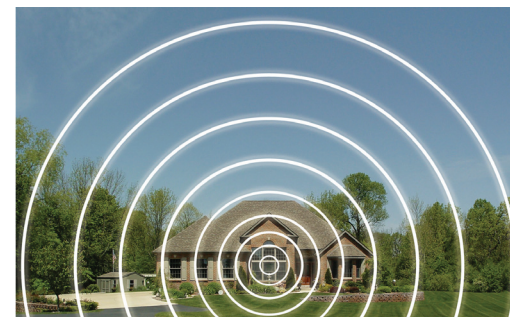
FreedomAlert's 2-Way Voice Communication Range

Because you are speaking through your pendant, FreedomAlert allows you to communicate your message from every corner of your home, outside in the yard and in the driveway. Emergencies can happen anyplace. And just one button activation.