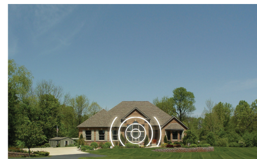
Typical Personal Emergency Response System's 2-Way Voice Communication Range as Speakerphone is in the Base Station