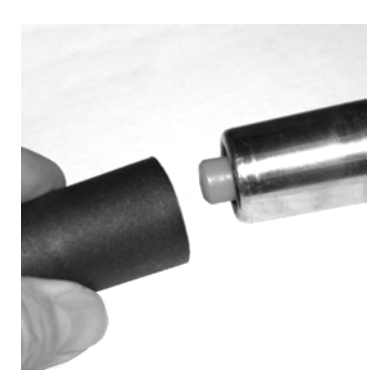
Remove the Black Cap and discard it before assembly. The Orange hydraulic button will become visible.