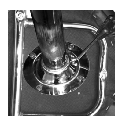
Use a wrench to attach the Seat Plate to the underside of the Seat with the provided bolts.