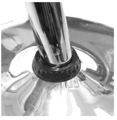
Press the Support Cylinder down firmly into the center hole.