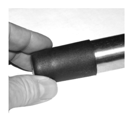
A Black Cap protects the hydraulic mechanism on the Support Cylinder.