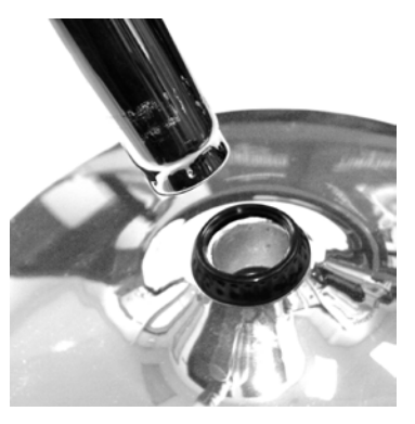
Place the wide end of the Support Cylinder into the center hole.