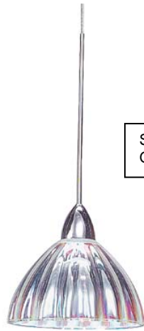
Shown with G518 Shade