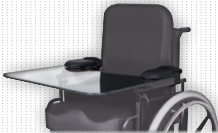
AVAILABLE WITH WEBBING, SWING AWAY, OR FLIP-UP ATTACHMENT.