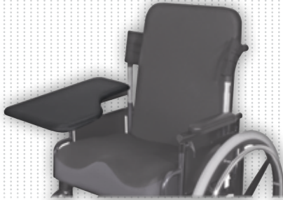
AVAILABLE WITH INTERLOCK AND SLIDE ON ATTACHMENT.