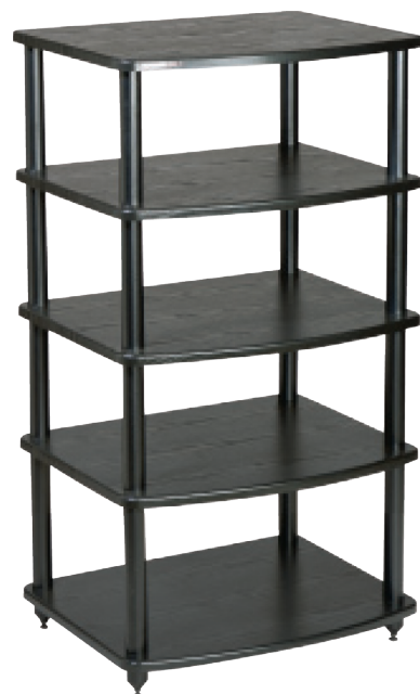
SE-A4 (Black Oak) <B> + AA1