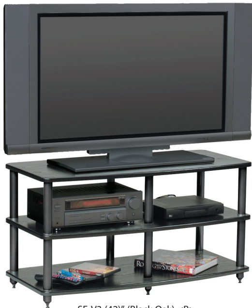
SE-V3 (42") (Black Oak) <B> (with center tube installed)

NOTE: All SE-V3 (42") video units include the necessary hardware to allow you to assemble the unit with or without the mid-shelf center tube (for center-channel considerations).