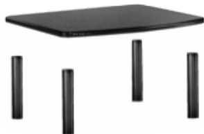
SE-AA1 (Black Oak) <B>