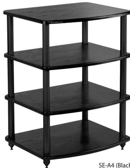
SE-A4 (Black Oak) <B>

NOTE: All SE-V3 (42") video units include the necessary hardware to allow you to assemble the unit with or without the mid-shelf center tube (for center-channel considerations).