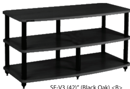
SE-V3 (42") (Black Oak) <B> (without center tube installed)