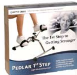
Model 314 Pedlar® 1st Step™