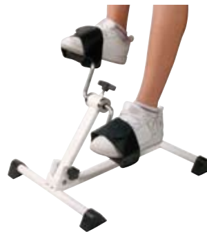
Model 316 Pedlar® Pro™