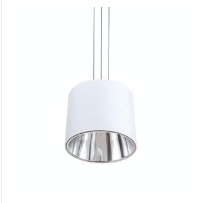
Pendant cylinder down-light. Specular baffle for glare reduction and improved light dispersion.

✉ 33 West Beaver Creek Road Richmond Hill Ontario Canada L4B 1L8 ☎ 800.660.5391 📠 800.660.5390 📧 info@eurofase.com 🌐 www.eurofase.com