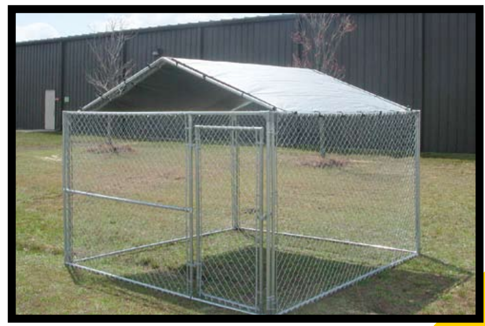
King Canopy Item #: DK1010PCS Cover, Elastic Ball Straps & Frame

10ft Wide x 10ft Deep x 1ft10in Height (Dimensions are of the Cover Assembly Only)