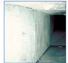
AFTER 10 YEARS