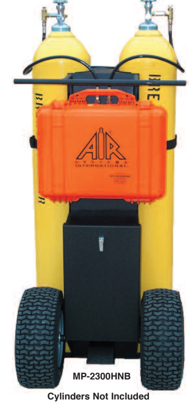
CONTROL BOX WITH ELECTRONIC ALARM

Black nylon cart cover for 2300 series carts