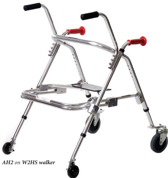
AH2 on W2HS walker