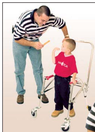
AB0 on W1BS walker