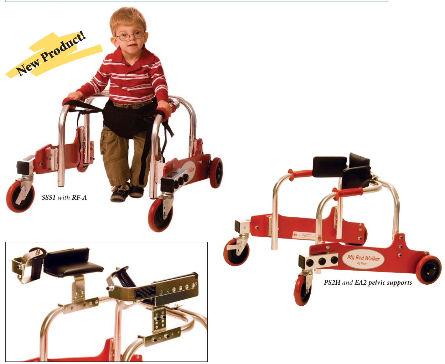
FSA forearm supports