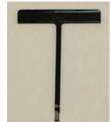
Header Card Holder