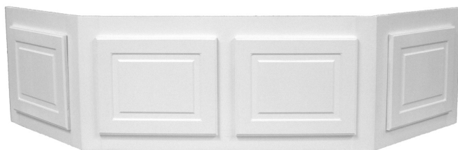
Corner skirt of Poplar / MDF with raised panel look construction.