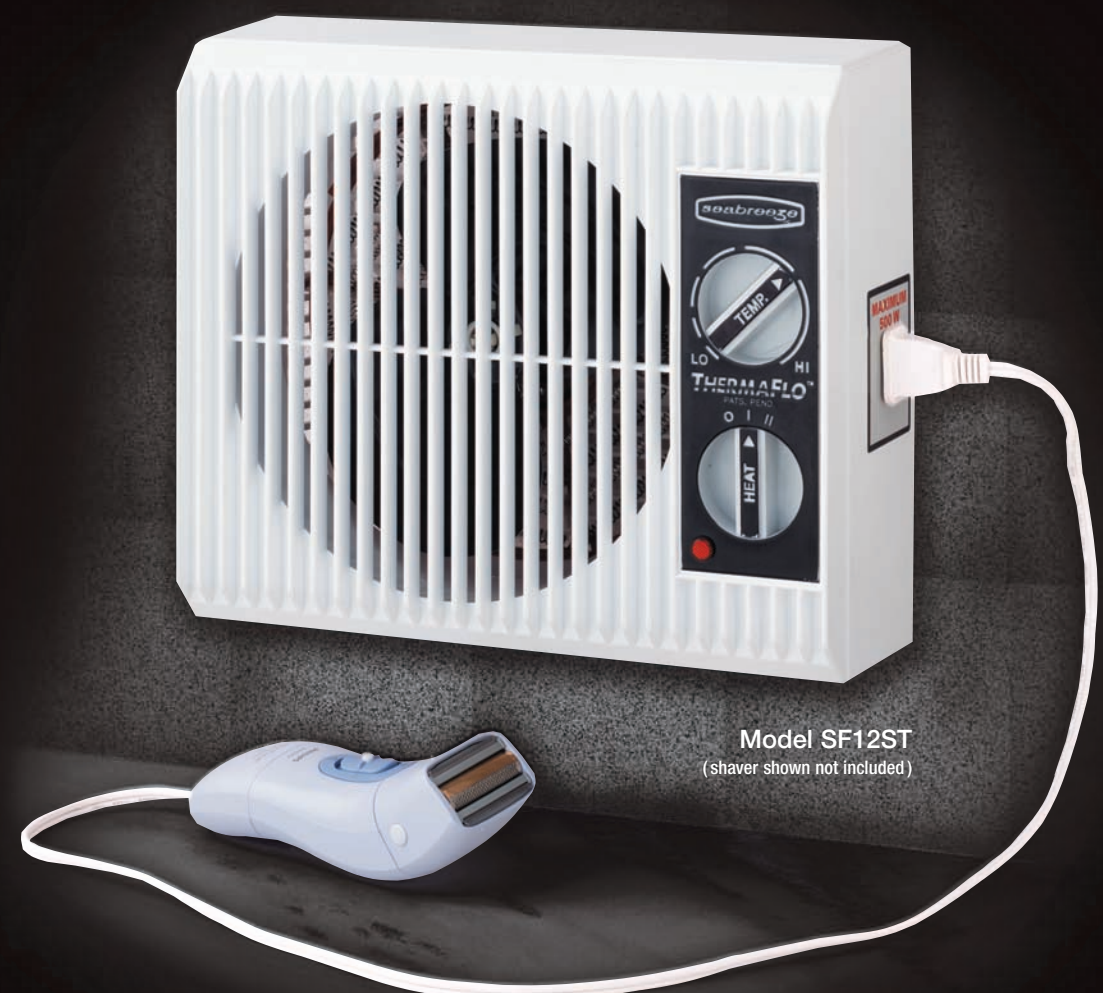
Model SF12ST (shaver shown not included)

THERMAFLO™ ... so advanced it's patented worldwide!