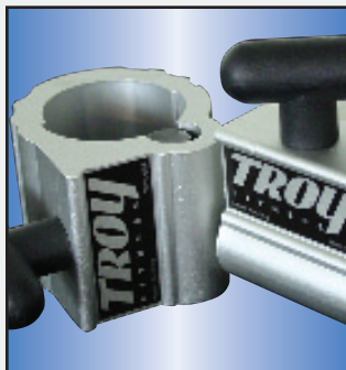
AOTC 2" "Bulldog" Metal Collar