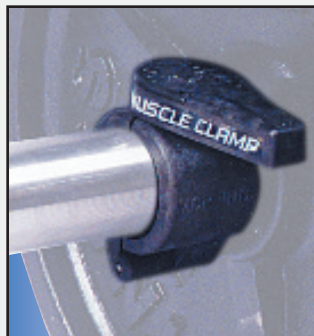
AOMC 2" "Muscle Clamp" Collar