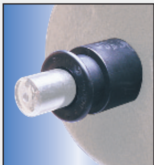
ARQC 1" "Quicklee" Plastic Collar