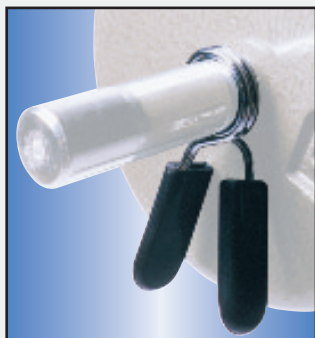
TRZC 1" "EZ-ON" Spring Collar