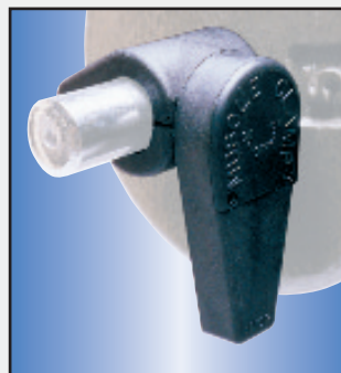
ARMC 1" "Muscle Clamp" Collar