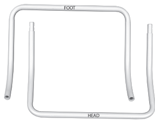
U-Shaped Support Bars