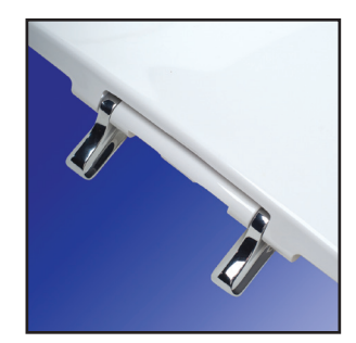
Corrosion resistant chrome and 304 stainless steel with two mounting positions