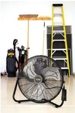
Converts Easily from Wall to Floor Use