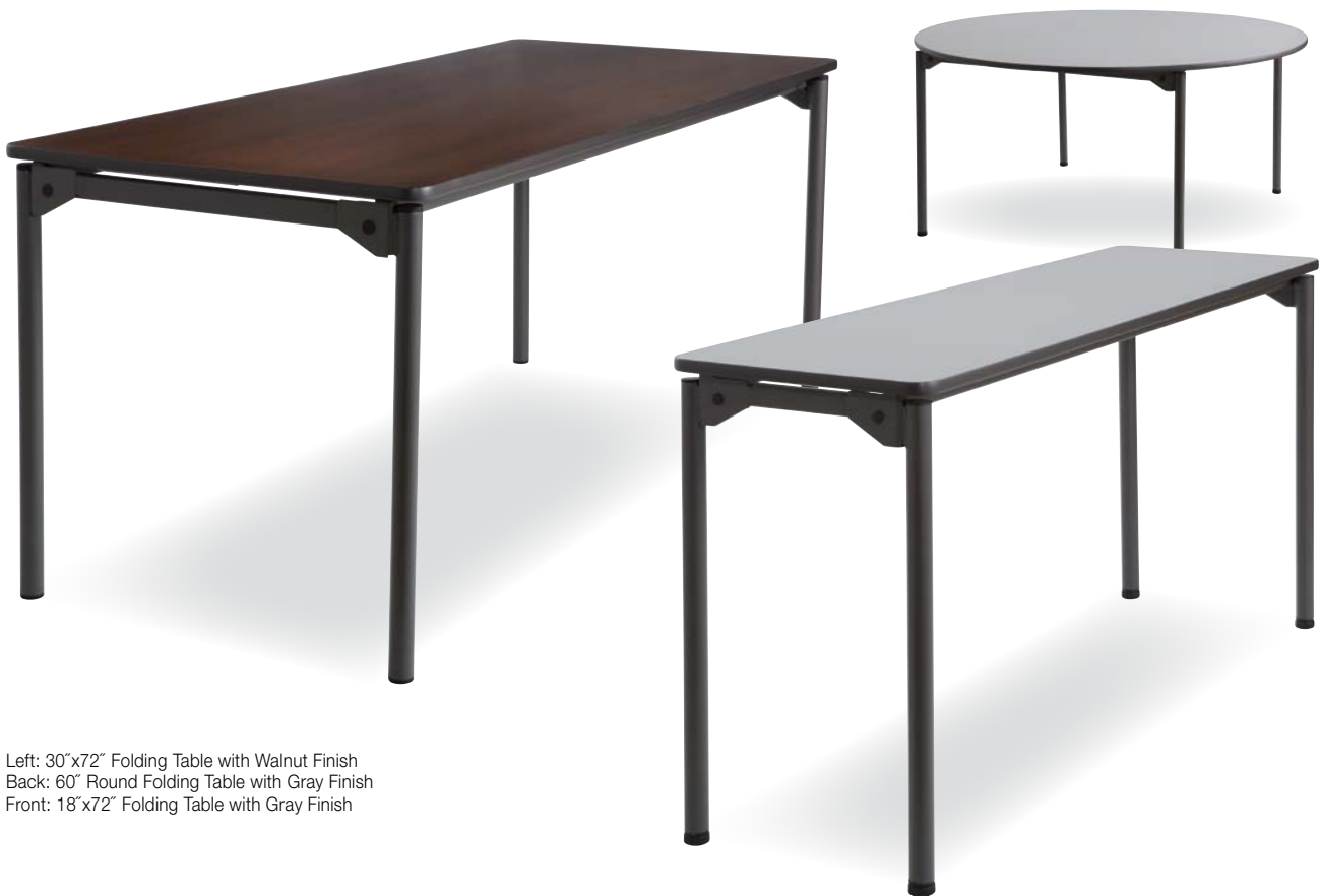
Left: 30"x72" Folding Table with Walnut Finish Back: 60" Round Folding Table with Gray Finish Front: 18"x72" Folding Table with Gray Finish

Extreme quality in a table that meets every commercial and institutional need. Innovative open corner leg design eliminates the need for a cross bar – providing maximum leg room and seating capacity. Single cam, one-hand leg fold release, saves set-up time.