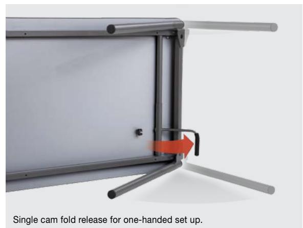
Single cam fold release for one-handed set up.