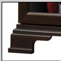
Raised base and leg detail