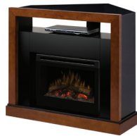
Converts to a corner configuration in seconds Depth: 29 3/4 in./75.5 cm

With its glossy black and rich walnut finishes this open concept media console will enhance even the most beautiful rooms. The media console comes with a separate corner attachment and support which can be stored at the back of the console when the unit is used against a flat wall.