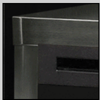
Stainless steel firebox enclosure

Elevated above a modern stainless steel firebox enclosure, the sturdy, smoked-glass top creates a sleek display space for the latest wide-screen TVs. Black lacquered cabinets, accented with smoked-glass doors, provide ample room for storing equipment, DVDs and other essentials.