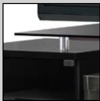
Elevated glass top