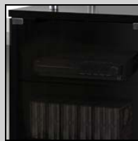
Smoked glass cabinet doors