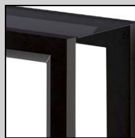
Smoked glass shelves