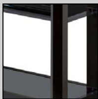
Easy access to storage