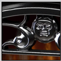
Cast metal front

Reminiscent of old-world craftsmanship, this elegant gloss black finish stove design harkens back to a less complicated era for a soothing, finishing touch in any room.