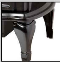
Cast metal legs