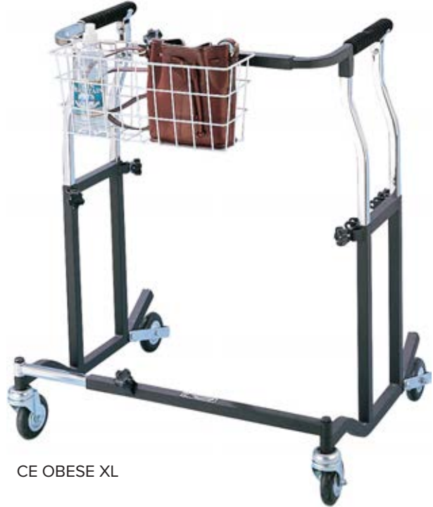
CE OBESE XL