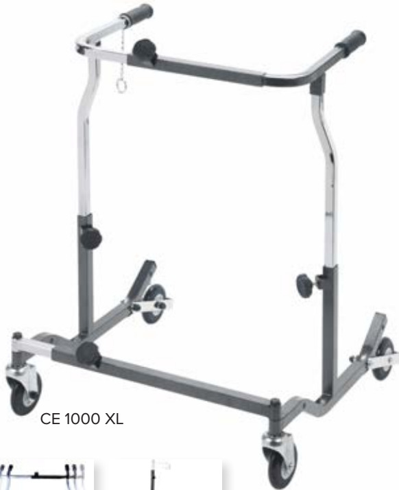
CE 1000 XL