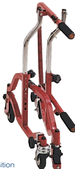
figure 2 folded position