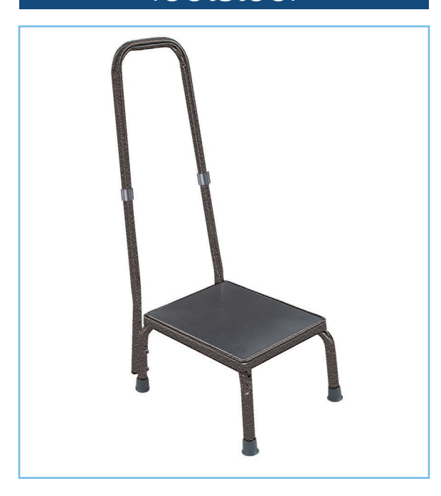
WEIGHT CAPACITY 300 LBS.