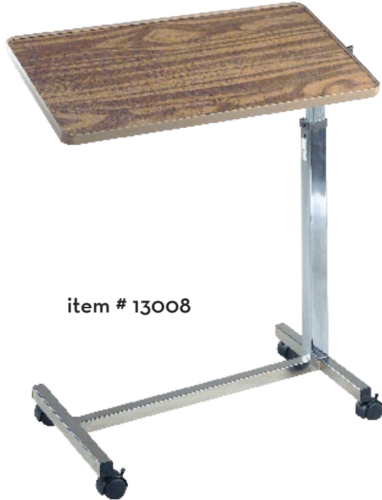
item # 13008