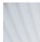
07 Opal Ribbed

Glass dimensions provided are nominal. Allowance must be made for dimensional tolerance in handcrafted glasses.