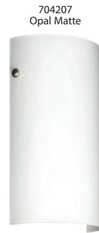
704207 Opal Matte