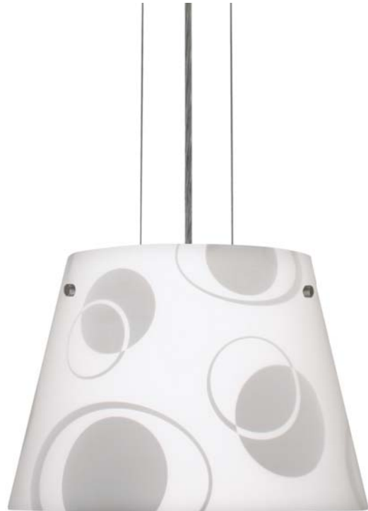
Cosmic • Satin Nickel Amelia 12 1KG-4393CS-SN

UL listed. Suitable for Damp Locations (interior use only)