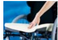
Removable Leg Wedge (RLW).