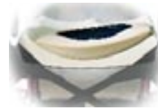
Adjustable Pelvic Obliquity (APO).