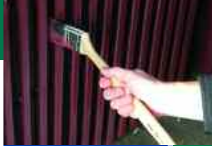
Painting inside the fins of a radiator with a Radiator brush.

Flagged tips on synthetic and bristle style brushes help them carry more paint to the work surface.