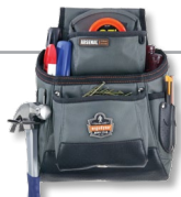
Arsenal® Synthetic Rigs

Bring tape measure around the widest part of your chest, under your arms, completely around your torso.