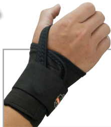
ProFlex® Wrist Supports

Measure around the palm. DO NOT include the thumb area. Use the size chart across the bottom of this page to double check your size choice.