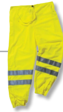
GloWear® Pants 8915/8925