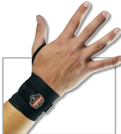
ProFlex® Wrist Wraps

Measure around the smallest part of the wrist.