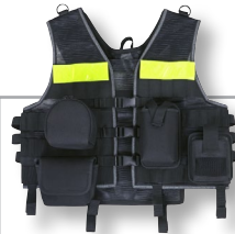
Arsenal® MOLLE Vest

Choose your synthetic belt size based on your pant waist size.