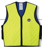
ChillIts® Cooling Vest 6665

Bring tape measure around the widest part of your chest, under your arms, completely around your torso.