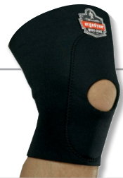
Ergodyne® Knee Sleeves

In a relaxed position, measure around the widest area of the forearm just below the elbow. For best fit, an elbow support should sit about 2-3 finger widths below the elbow crease.