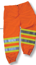
GloWear® Pants 8910/8911

Vests & Vests w/Sleeves are sold in combined sizes: S/M, L/XL, 2XL/3XL, and 4XL/5XL. *Note: 8240HL is available in M/L and XL/2XL only.