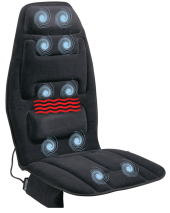
10 motor massage cushion with heat

Please read all instructions before using model 60-2910.