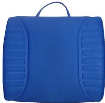
Cushion (color may vary)

Connect the 12V AC/DC adapter to the massage lumbar cushion and outlet.