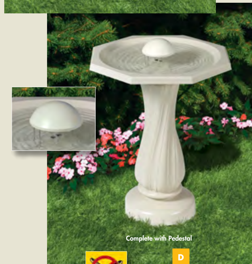
Complete with Pedestal

Easy to use, 20" diameter birdbath and pedestal with Water Wiggler sets up quickly and is easy to clean. The gradual slope on the bowl is easy for birds to use and it will not crack in freezing temperatures.