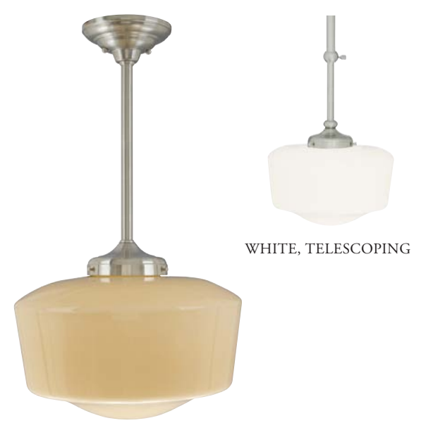
LATTE, FIXED-LENGTH Shown approximately 15% actual size.