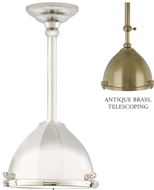
POLISH NICKEL, FIXED-LENGTH Shown approximately 15% actual size.