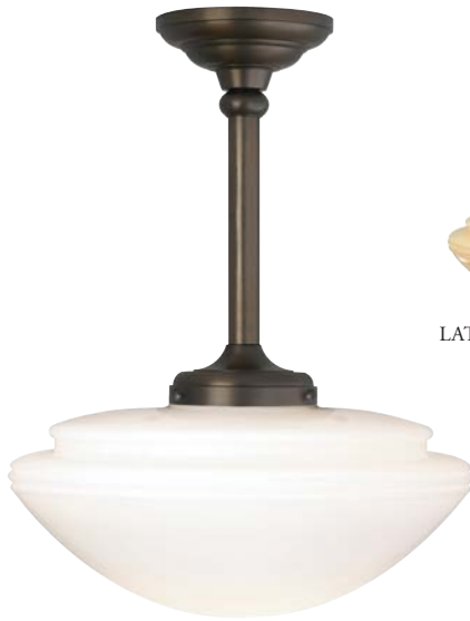
WHITE, FIXED-LENGTH Shown approximately 20% actual size.