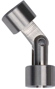
Shown approximately 85% actual size.