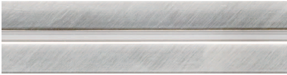
Shown approximately actual size.