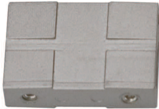
Shown approximately 110% actual size.