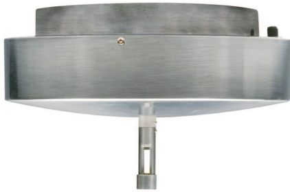
Shown approximately 25% actual size.

SINGLE-FEED, 12 VOLTS 300 WATTS, MAGNETIC